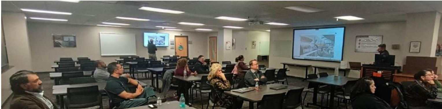
MS Color Selection Committee