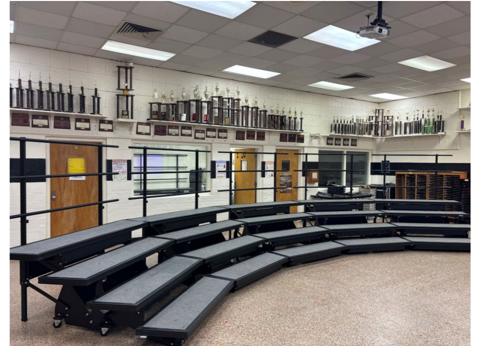
Risers at Wilson & Young Middle School